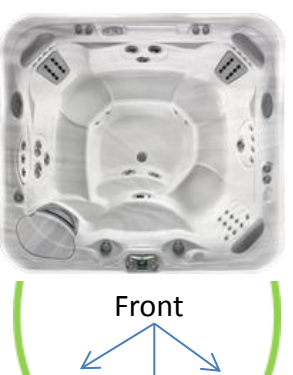
30 ft. (9 m)