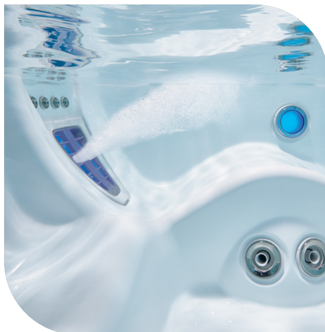
Moto-Massage® DX Jet exclusively available in Highlife® Collection spas.

Above-ground hot tubs generally feature anywhere from 20 to 100 jets targeted to certain muscle groups to help you relax and emerge from your spa feeling your best. When comparing models, look for powerful, patented jets that will provide the type of massages your body needs. Also look for targeted jet groupings. More jets doesn't always mean a better experience. Often, fewer jets in targeted groups will provide a better, more focused massage. Jet groupings can also help conserve energy.